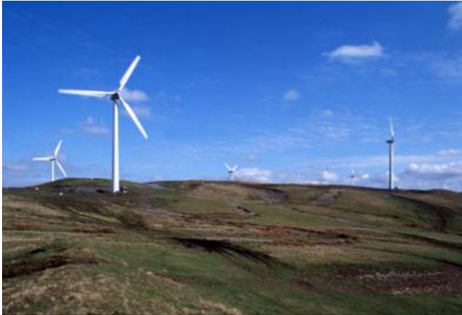
Rural Wind Farm – near Aberystwyth, Ceredigion

Assessment of the possible noise impact of proposed Wind Farm sites is an important factor when considering environmental pollution, public health and amenity value of dwellings close to the site.